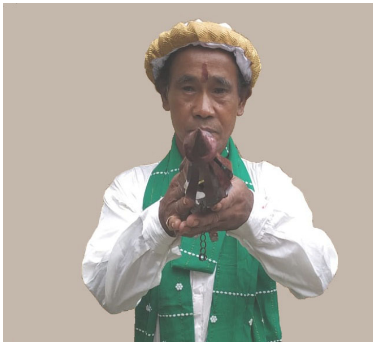
Fig: Use of Mudura (Dorje or Vajra) in Jagar song

Creation of flavour & entertainment is the basic rule of the Vyah-gowa Ojapali . The worship of Vasudeva is reflected in the fully white colour and his possessing eight arms are reflected in eight assistants (Pali). As like the ancient Pravandha Geet related to Meen-Nath, Gorukh-Nath and others, the ritual of the Jagar also celebrated by this school when their performance in the royal court. As similar as the Vajra, Tibetan Dorje , the Oja , that is, the master performer used one such article called Touzyatrika Mudra or Mudura in the right hand particularly in the presentation period ( Jagar ) at the Royal Court.